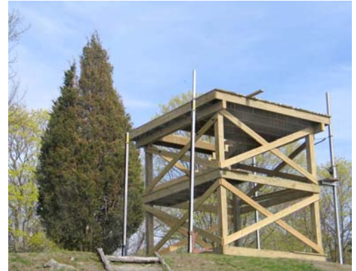
The new observation tower at Fort Barton is almost ready to use.