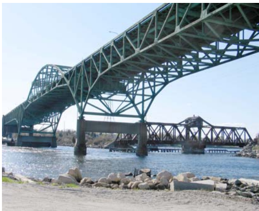
The old Railroad Bridge under the Sakonnet River Bridge comes down this year.

which may in turn link up to a bike path here in town running south along Main Road to Stone Bridge. There are several plans being considered along with several funding options under consideration. State, and possibly federal grants, will