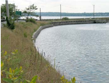
The Stone Bridge Abutment area, which is being considered for a park area.